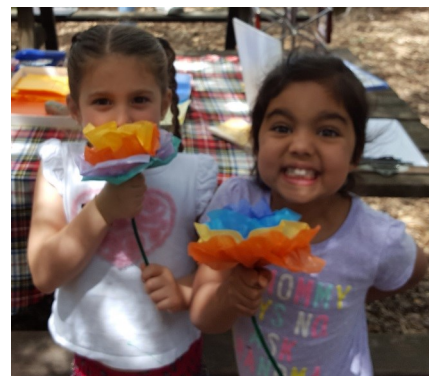
Making Mexican paper flowers at the Wildlife Festival in April 2018