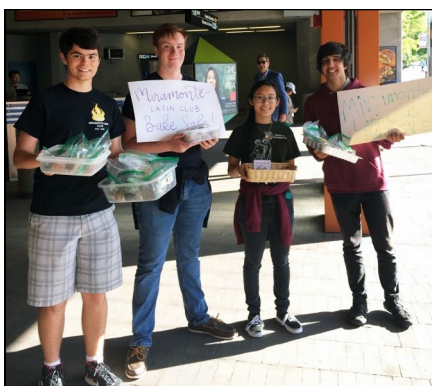
Miramonte Latin Club Students at their Bake Sale for the FJMA

The Miramonte High School Latin Club held a bake sale and a coin drive during their 2018 spring semester to raise funds for the Friends of the Joaquin Moraga Adobe. What a delicious way for these students to help preserve the Adobe! A member of the Miramonte Latin Club organized these events and has been our liaison with the school. This student has attended many of our board meetings, and FJMA very much appreciates their enthusiasm for this cause. The Latin students impressively raised over $400 for the Adobe!