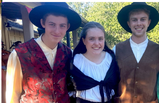
Miramonte Students dancing at the Fandango on August 25th