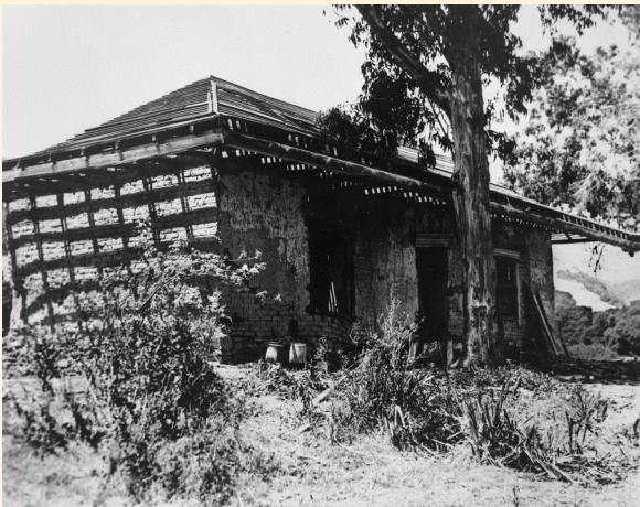
Moraga Adobe circa 1935