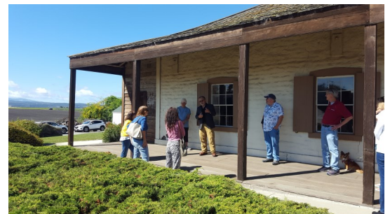
Boronda Adobe Visit, Salinas - September 2021