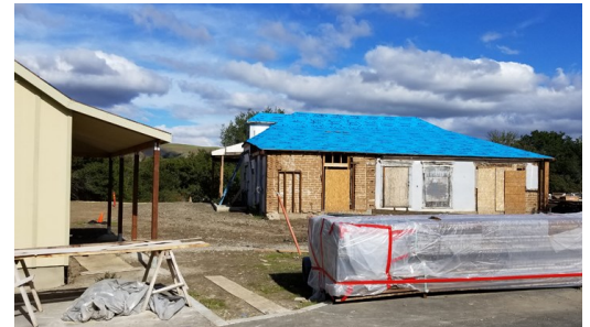
Moraga Adobe - October 31, 2021

At the Adobe site, construction continues. The new outbuilding with bathrooms and a storage room has been built. New wooden post supports are currently being installed at the Adobe front porch. J&J Ranch is hopeful the Adobe rehabilitation will be completed mid-2022 at which time the FJMA will be deeded the property.