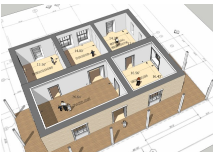
Moraga Adobe 3D Floor Plan

Starting this September, a newly formed FJMA Museum Committee has been meeting to plan the interior of the Adobe. We have finalized a floor plan with three rooms being furnished in 19th century Rancho style furnishings, a separate room for historical displays, and a rotating special exhibits room. We are happy to have found an artisan who specializes in making reproduction furnishings and items from the Rancho period that will be perfect for our museum!